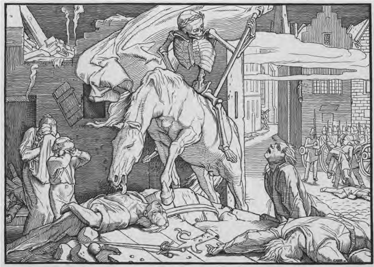
A drawing, from the time, of the disturbances in Berlin. It is entitled 'The Dance of Death, 1848'.