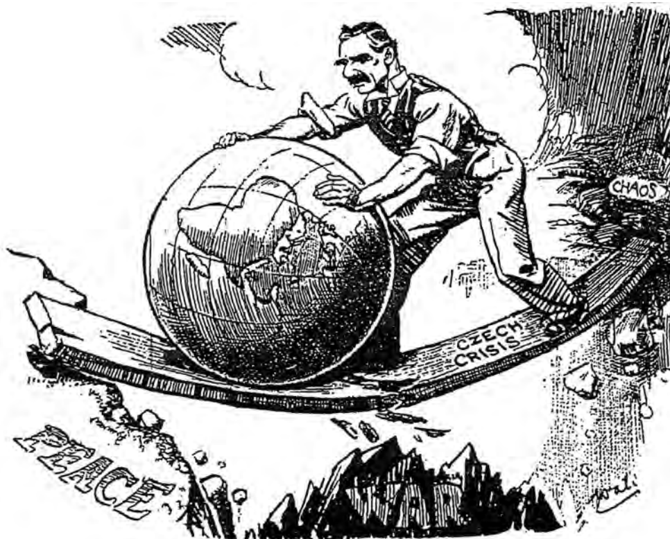
A cartoon published in a British newspaper on 25 September 1938. The man in the cartoon is Chamberlain.